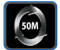
50 Million Keystrokes