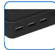
Built-in 3-Port Hub