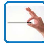
Ultra-Slim and Aluminum Design