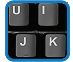
2X Letter Print Size