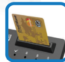
Smart Card Reader